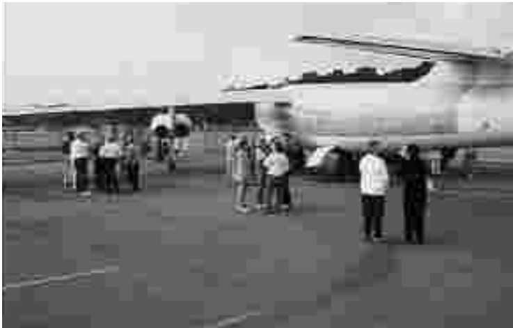
Reunion Attendees and a Boeing B-47, "Up Close and Personal".