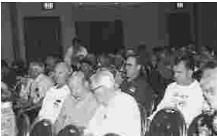
A little business amid the weekend filled with fun.