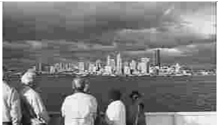
Seattle Skyline on the boat trip to